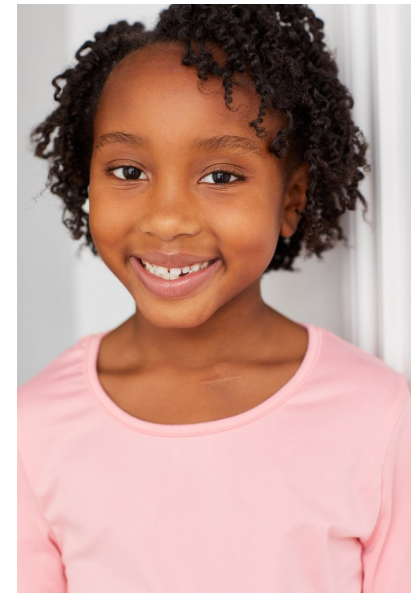
NEAL HAMIL AGENCY

7887 San Felipe, Suite 110, Houston, TX 77063 Tel: 713 789 1335 Houston | 214 220 0300 Dallas | 713 789 6163 Fax Email: modeling@nealhamilagency.com | acting@nealhamilagency.com